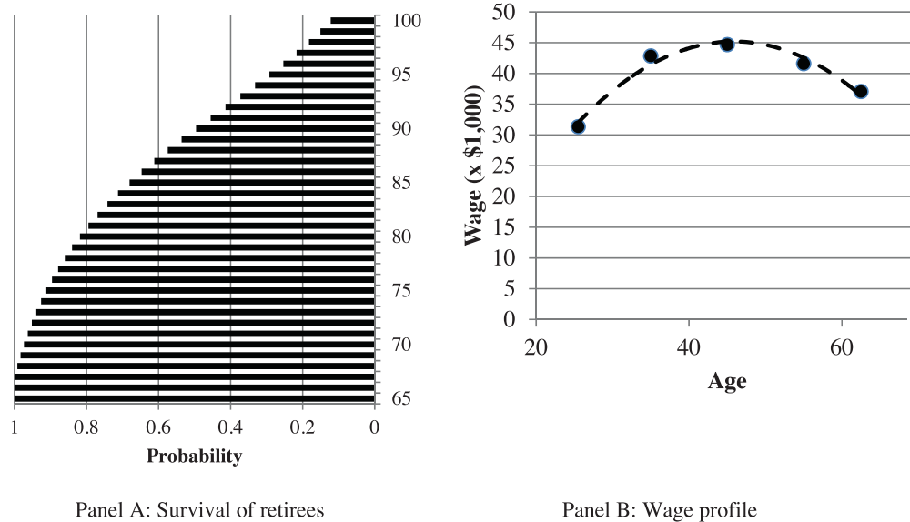
Fig. 1. Demographics and wage profile.

This figure shows the demographical distribution and wage profile that is used for the generations in the model. They are obtained from the Office for National Statistics (ONS). Panel A has the survival probabilities as of age 65 from the 2060 Projection of survival probabilities. (We assume 100% survival until age 68, see the text). Panel B has the UK wage profile 1997–2012, and represents the average yearly wage (in US-dollars) for a worker of each age, using an exchange rate of $1.50 per pound.